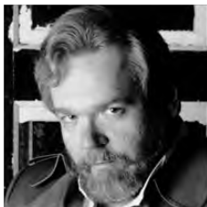
Walter Jon Williams